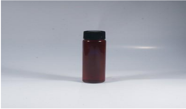
Cobaltous sulfate Solution