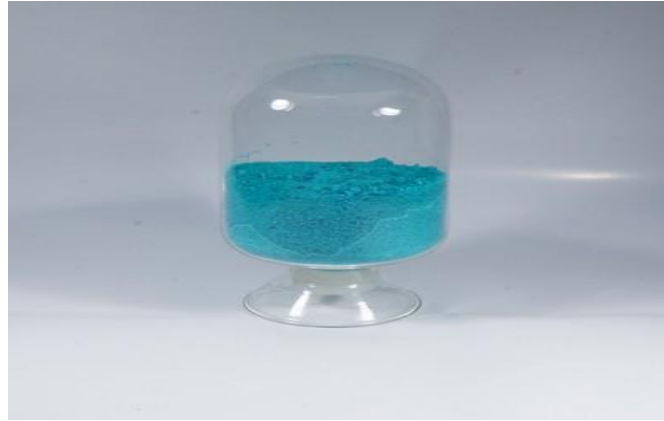
Nickel(II) sulfate hexahydrate